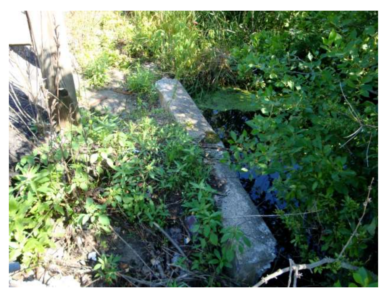
4449 monitoring site - side view of concrete outfall - brook runs behind Morris Farm under Rt. 117A to monitoring site