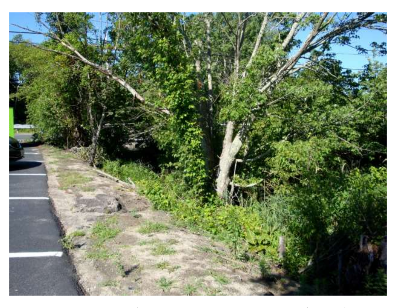
4444 parking lot with eroded bank (approximately 12 spots in length to the right of green bin)