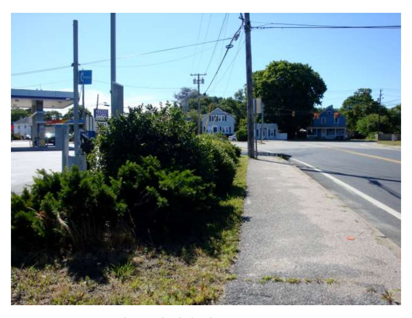
4443 intersection Rt. 117A and 117 - parking lot length to monitoring site