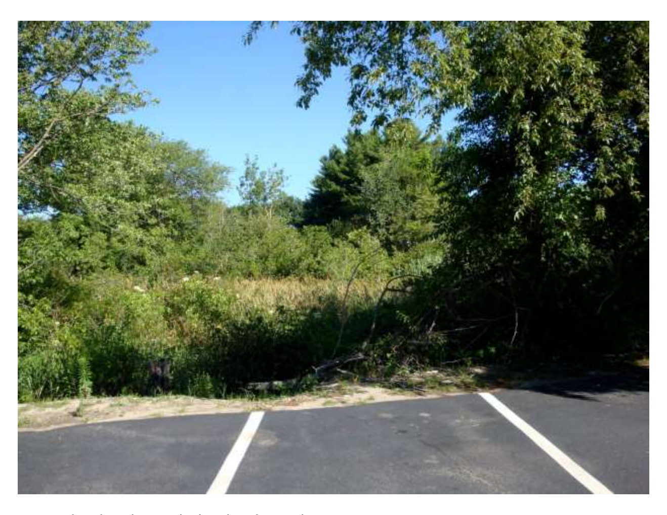
4447 parking lot edge overlooking brook growth