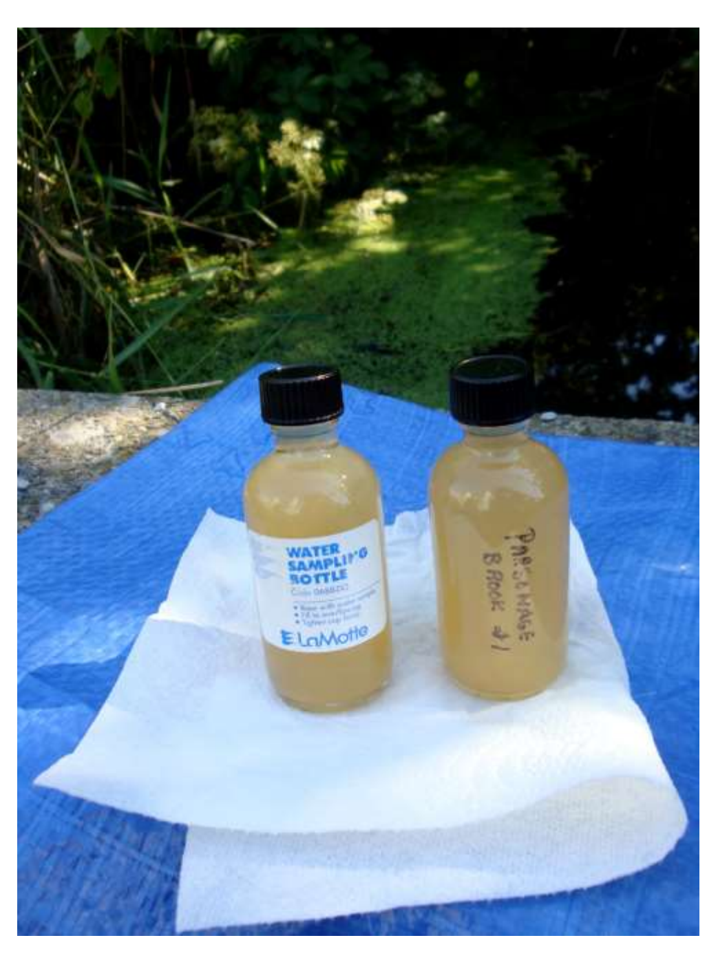
4441 bottles for dissolved oxygen testing (waiting for floculant to settle before final "fix")