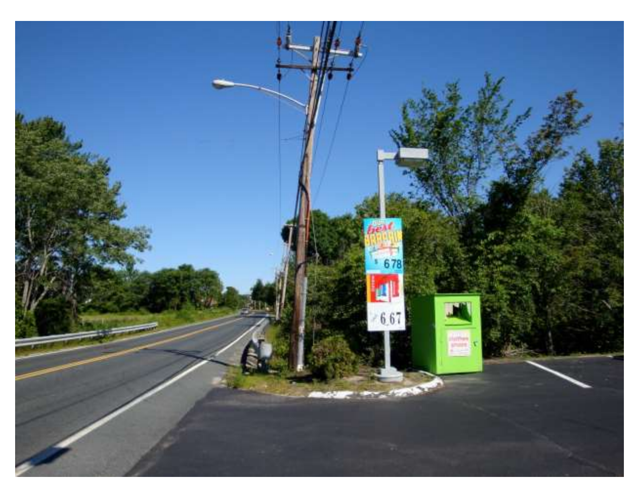
4442 Rt. 117A Warwick Avenue - monitoring site - behind green bin and right of street light. (Morris Farm is far left.)