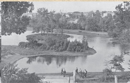
MERINO PARK ON A SUMMER DAY