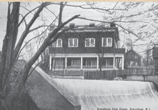
Greystone Club House, Greystone, R.I.